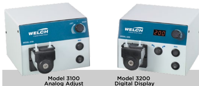
Model 3100 Analog Adjust